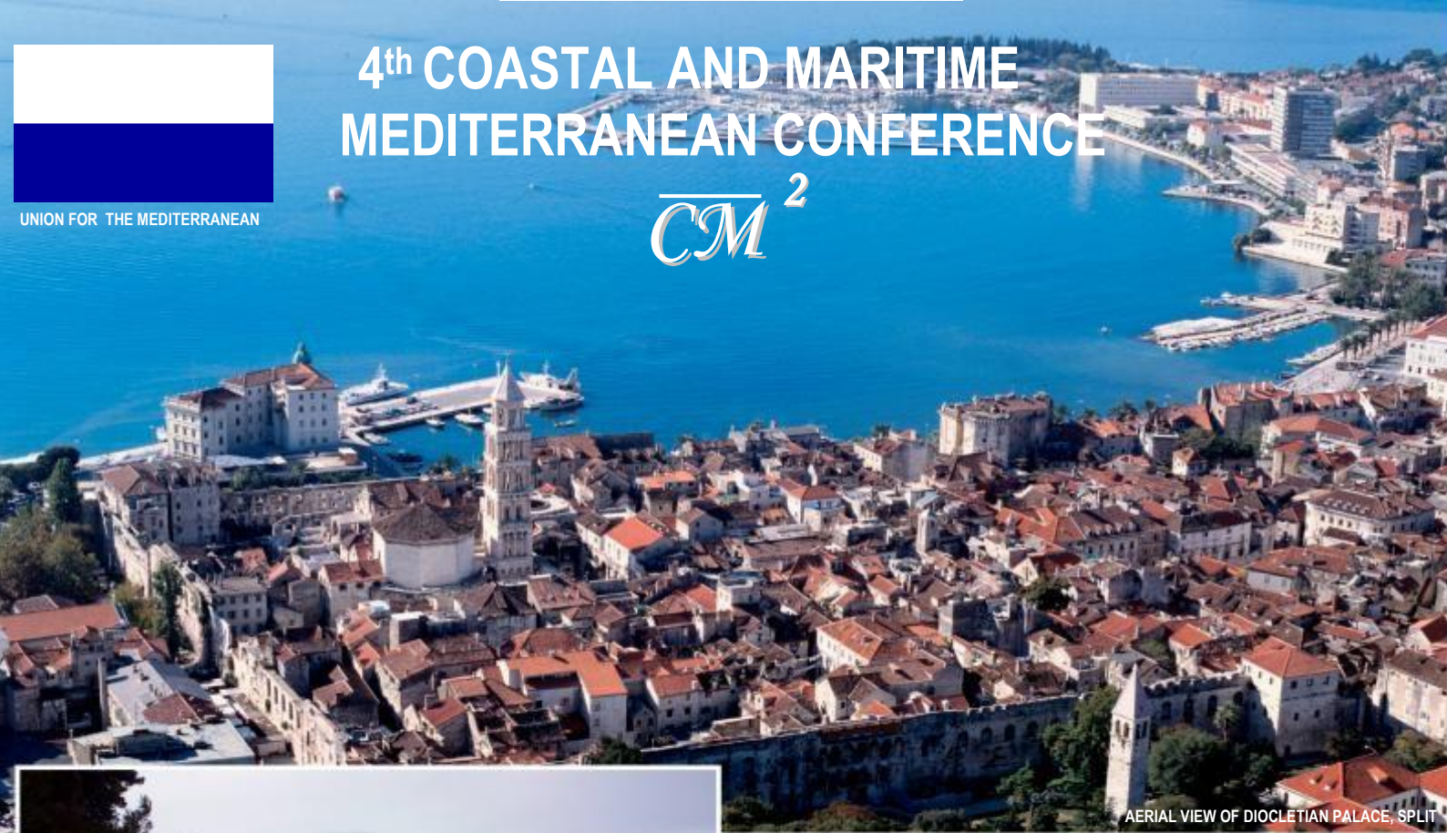
AERIAL VIEW OF DIOCLETIAN PALACE, SPLIT