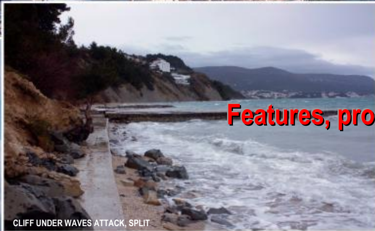
CLIFF UNDER WAVES ATTACK, SPLIT