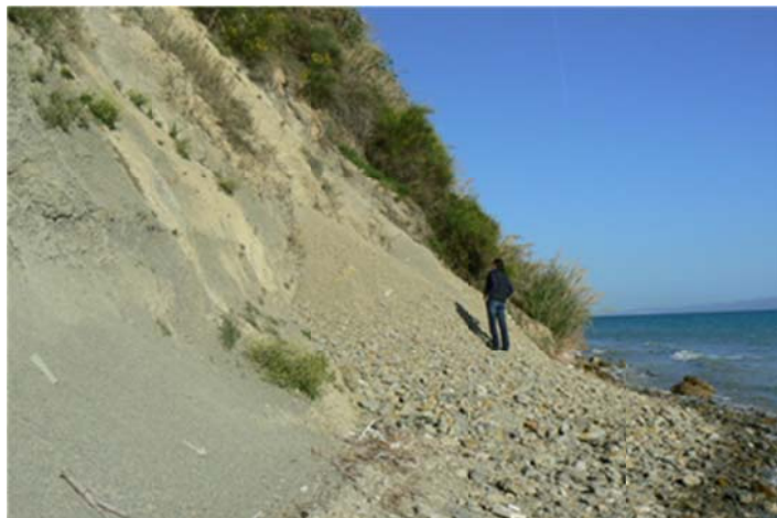
Figure 3. Accumulation of the eroded material in form of the cone pile.

shown by PIKELJ et al. , (2014). All profiles revealed that accumulation was predominant on the cliff toe during the spring/summer season, while erosion prevailed during the cold period, which might be related to enhanced marine abrasion.