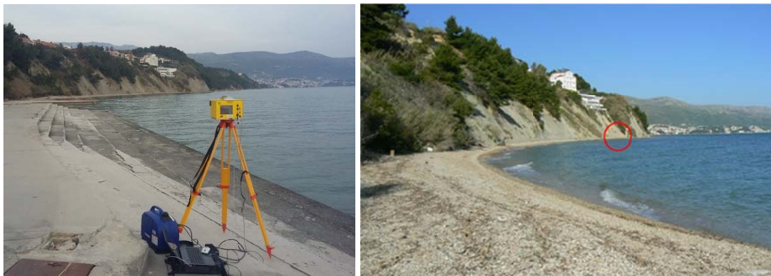
Figure 1. Position of the TLS (left) and the conus like material (right, in red circle).

The study site is a vegetation-free part of the ~30 m high coastal cliff formed in Eocene flysch assemblage (interbedded marl, siltstone, sandstone), located on the southern side of the Duilovo plateau in the Split urban area (figure 1). Flysch is a less prevalent rock assemblage along the carbonate-dominated Croatian shoreline and cliffs are a rare landform (PIKELJ & JURAČIĆ, 2013). Top of the studied cliff is an inhabited area, containing tourist and agricultural infrastructure, and threatened by ongoing erosion. In order to make an adequate erosion risk assessment in the future, this study aims, for the first time, to quantify flysch cliff erosion rate on the Croatian coast and to detect main erosional processes involved. To quantify cliff erosion, terrestrial laser scanner (TLS) was used.