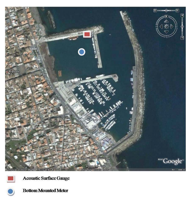
Figure 1. Riposto marina, with wave gauge positions.

Both instruments had independent data logging capabilities and one of them (DCU 1103) also had a real time data connection through a GSM mode. Standard algorithms (Zero Crossing, FFT) were performed to extract wave parameters of interest. More than six months of data were collected, with some interruptions during long power breaks caused by very heavy storms.