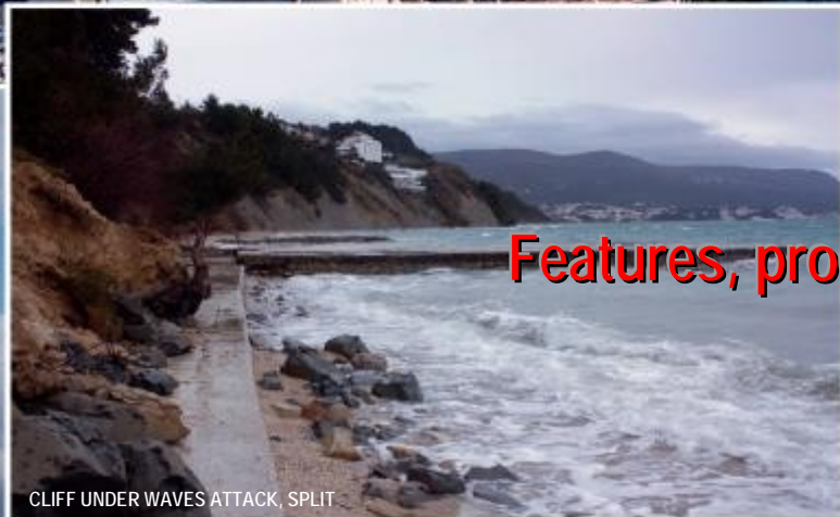
CLIFF UNDER WAVES ATTACK, SPLIT