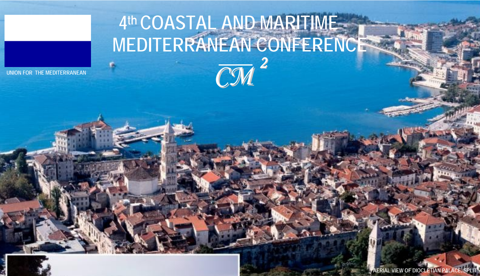
AERIAL VIEW OF DIOCLETIAN PALACE, SPLIT