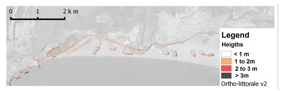
Figure 3. Example of dike detections (sea dike in Camargue).

The results (see Figure 3) highlight elevations higher than 1 metre, characterizing the dikes, artificial or natural embankments.