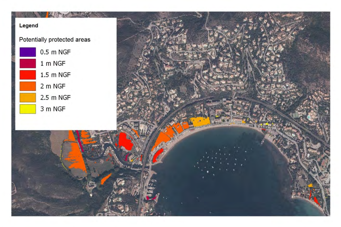
Figure 2. Example of results for potentially protected area (Baie d'Agay).

Some limitations were identified during the implementation.