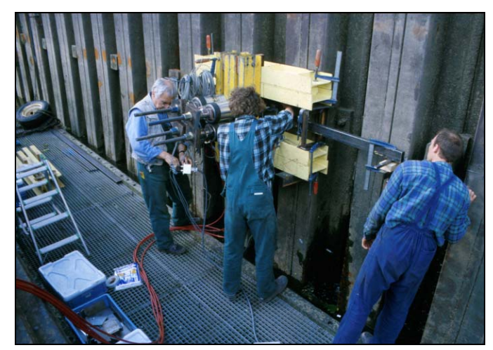
Figure 4. Load tests of anchored sheet pile wall.

The quay of the former shipyard AG WESER in Bremen, northern Germany, consists of a two level re-anchored sheet pile wall to restrain an altitude difference of 20 m. The wall showed local horizontal deformation up to multi-decimeters. By using a mobile loading set-up (Figure 4) broken anchors as well as still existing anchor forces could be identified, providing a basis for the planning and execution of reinforcements. Today, one of the main shopping malls of the city of Bremen, the Waterfront Shopping Mall, is located in this area.