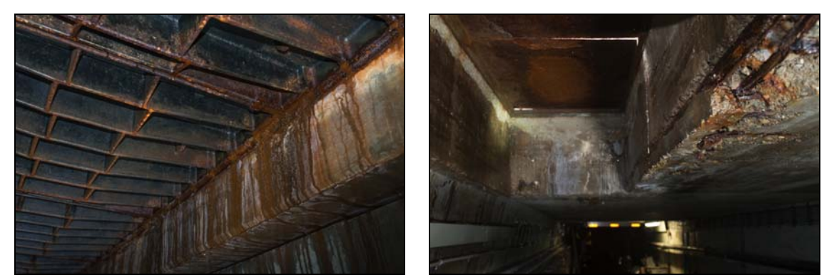
Figure 2. Leaky hatch cover - left damage class 2 – water seepage and corrosion at the steel cover; right damage class 4 – reinforcement corrosion with reduction of cross section and concrete spalling.

The assessment of functional soundness and structural stability is based on the review of planning and construction documents, on-site visual inspection, on-site and laboratory material testing as well as hydraulic and structural calculations. Often, an assessment of the structural condition is difficult as inventory documents are missing, the load path is unclear and damages are so severe that the possibility of a sudden failure of the structure cannot be denied by theoretical calculations. Therefore, experiments can be the appropriate alternative to make a reliable statement on the available load capacity. By experiments, load restrictions or even a closure of the structure may be prevented and a proper and sound planning of repair or replacement works may be possible.